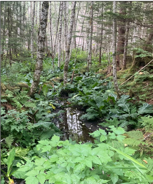
Figure 3. Stream channel at waypoint 479.