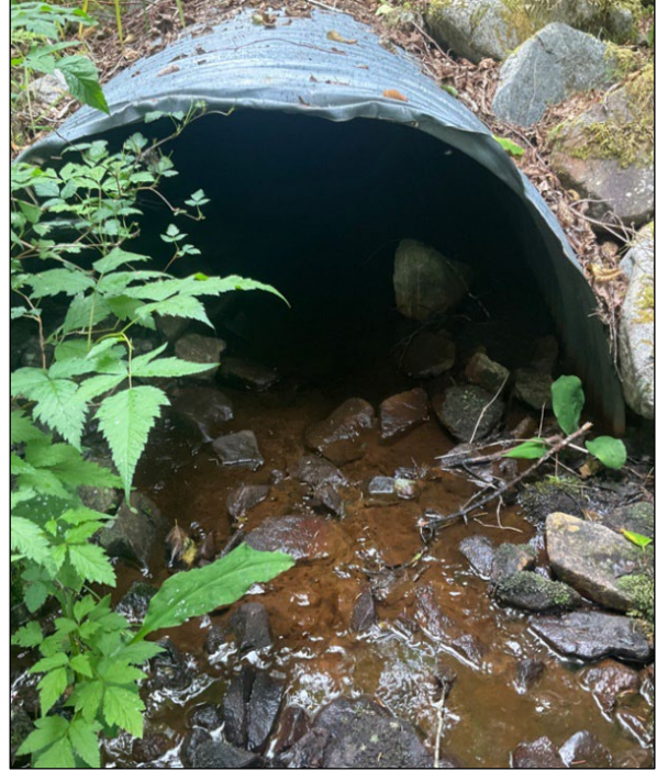
Figure 2. Culvert inlet at waypoint 479.