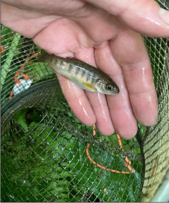
Figure 1. Juvenile coho salmon caught at waypoint 479.