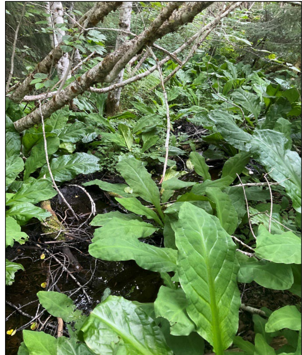
Figure 4. Stream channel at waypoint 507.